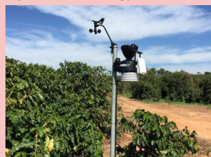
Technology takes over the agriculture sector ever more. Farmers are no longer dumb; they are technologically trained and proud to be working in the eradication

They are attached to a tractor or to its implement that record the actual changes in the soil, such as available nitrogen content or weed infestation. These sensors are used for variable-rate application where pesticides, fertilizers, and seeds are applied to measured soil's or crop's characteristics accordingly.